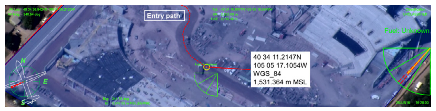
Analysis of video surveillance on a construction site